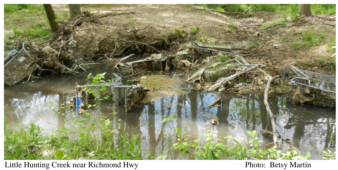
Little Hunting Creek near Richmond Hwy