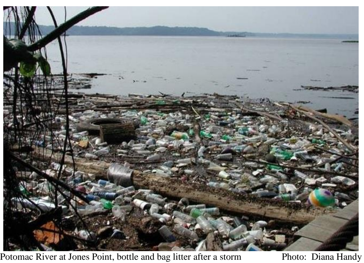
Potomac River at Jones Point, bottle and bag litter after a storm