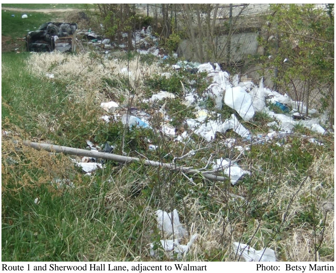
Route 1 and Sherwood Hall Lane, adjacent to Walmart