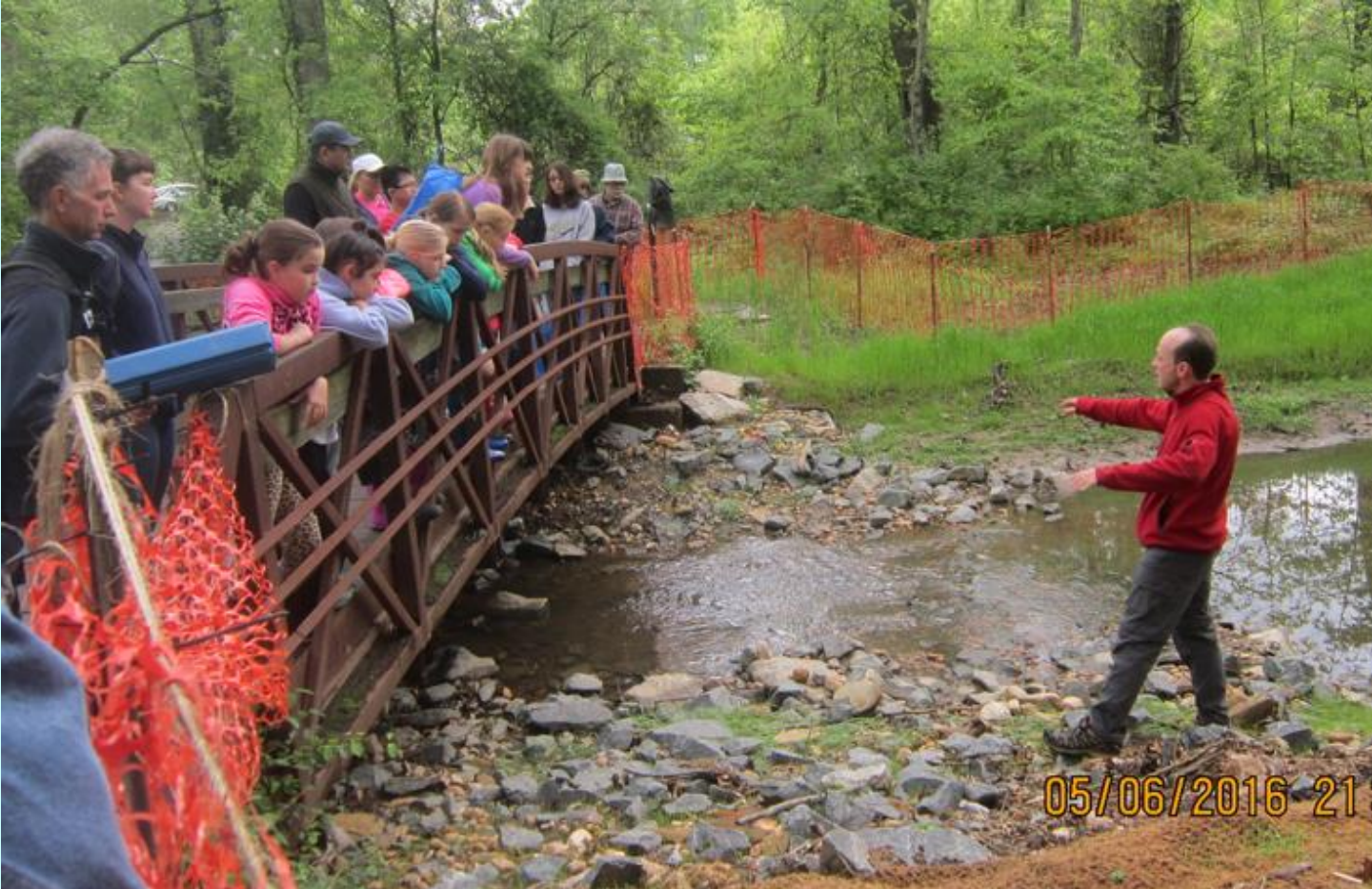
Wakefield Park - nature walk