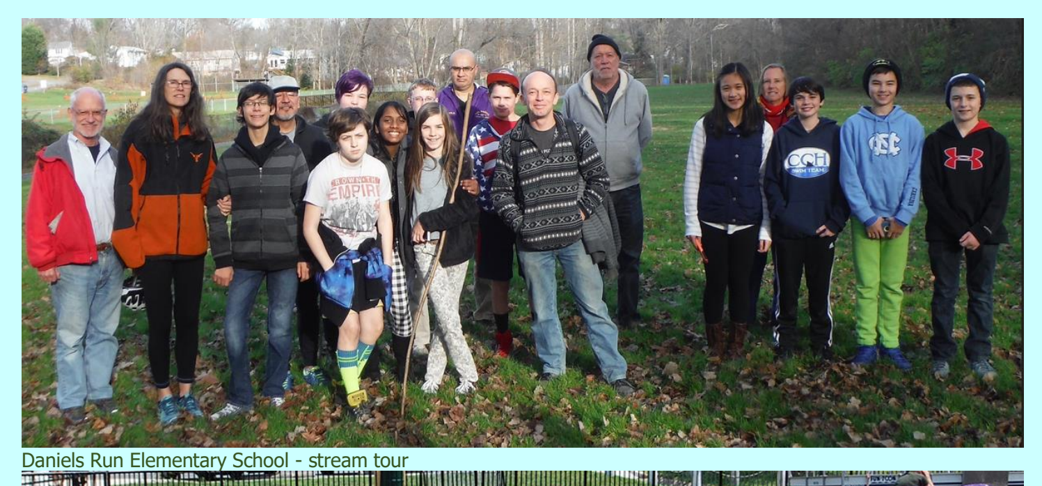
Lake Accotink - Inspiring Connections Outdoors youth outing