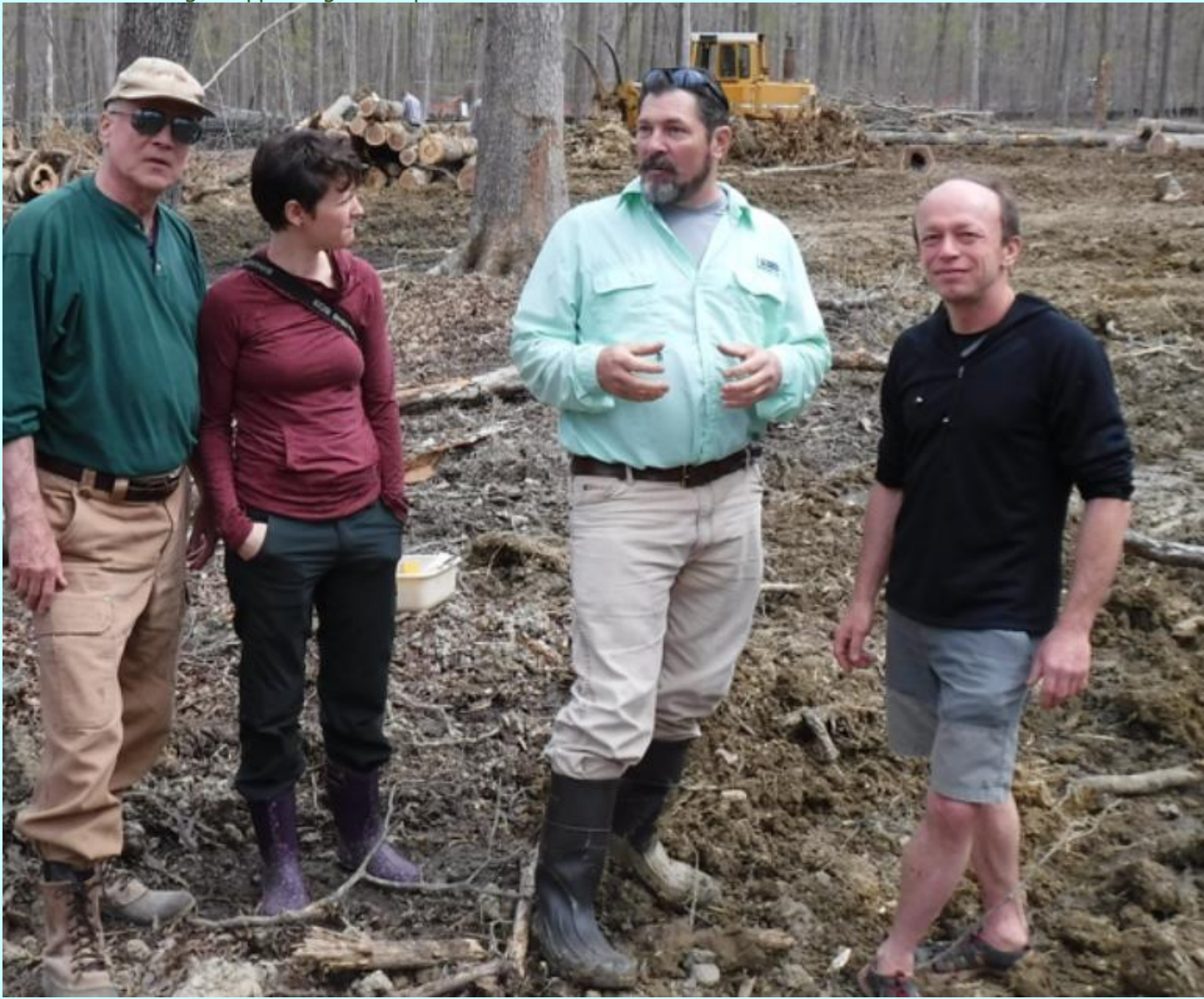
Fairfax - defending disappearing vernal pools