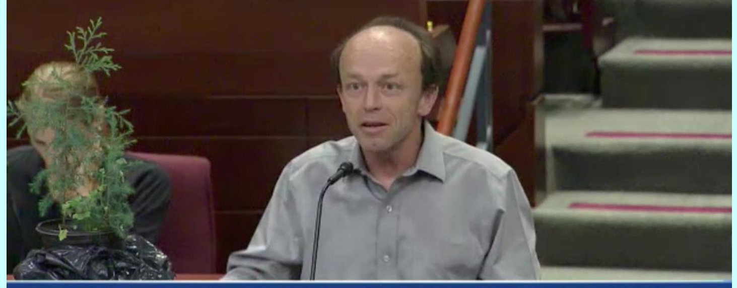
Public Hearing on Proposed Site Specific Plan Amendment (SSPA) 2018-I-1MS, Testimony before Board of Supervisors Read a fine example of Kris' advocacy in his own words