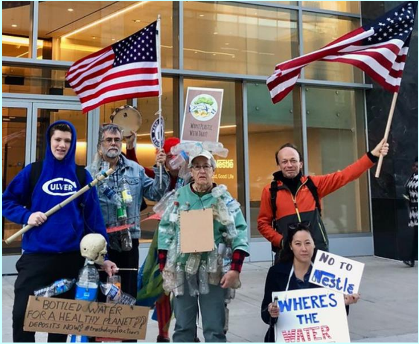
Trash Action Workforce Day of Action