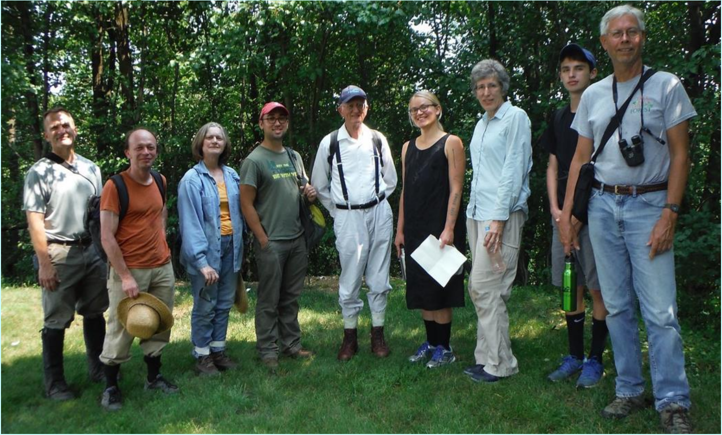
Accotink Gorge - botanical exploration