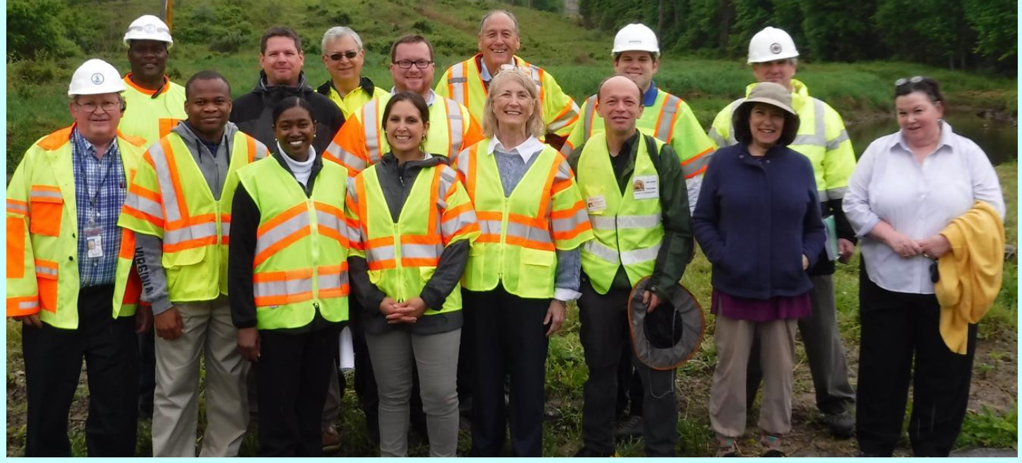
I-495 - erosion control inspection