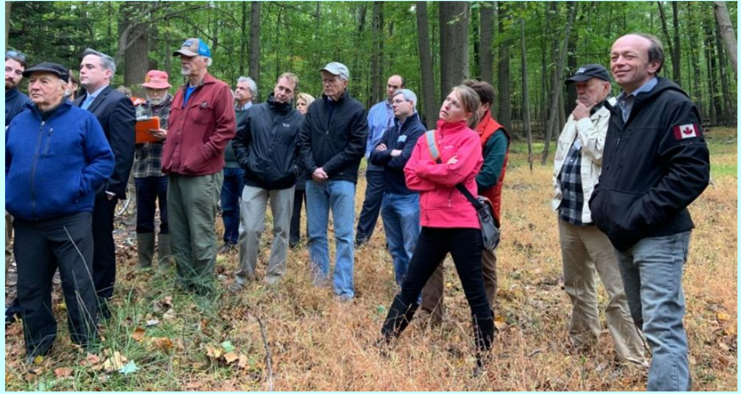
Inova Merrifield - forest preservation walk