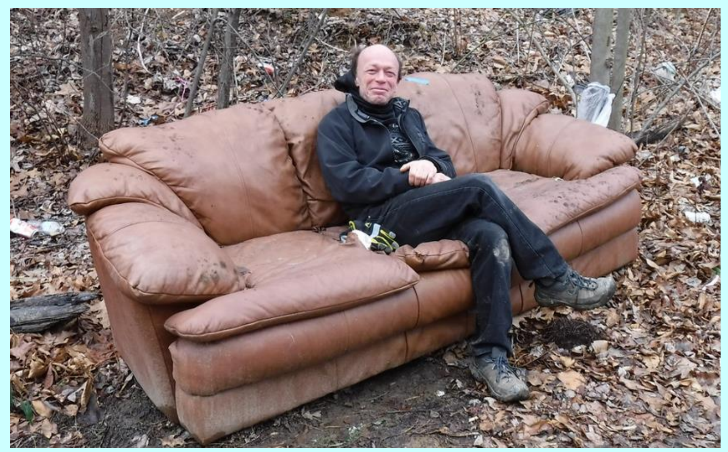
Americana Drive – illegal dumpsite cleanup