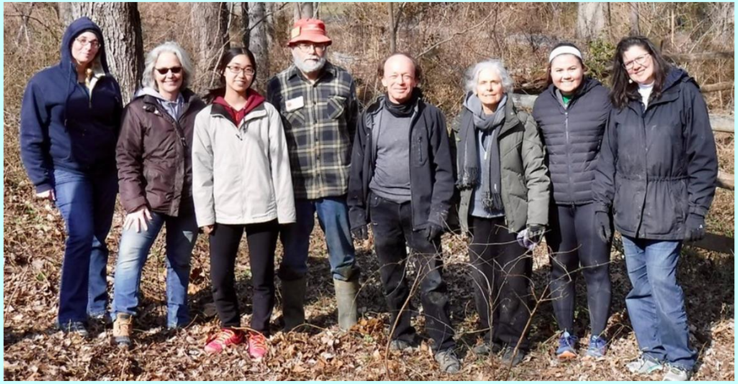
Daniels Run Elementary School - outdoor classrooms upkeep