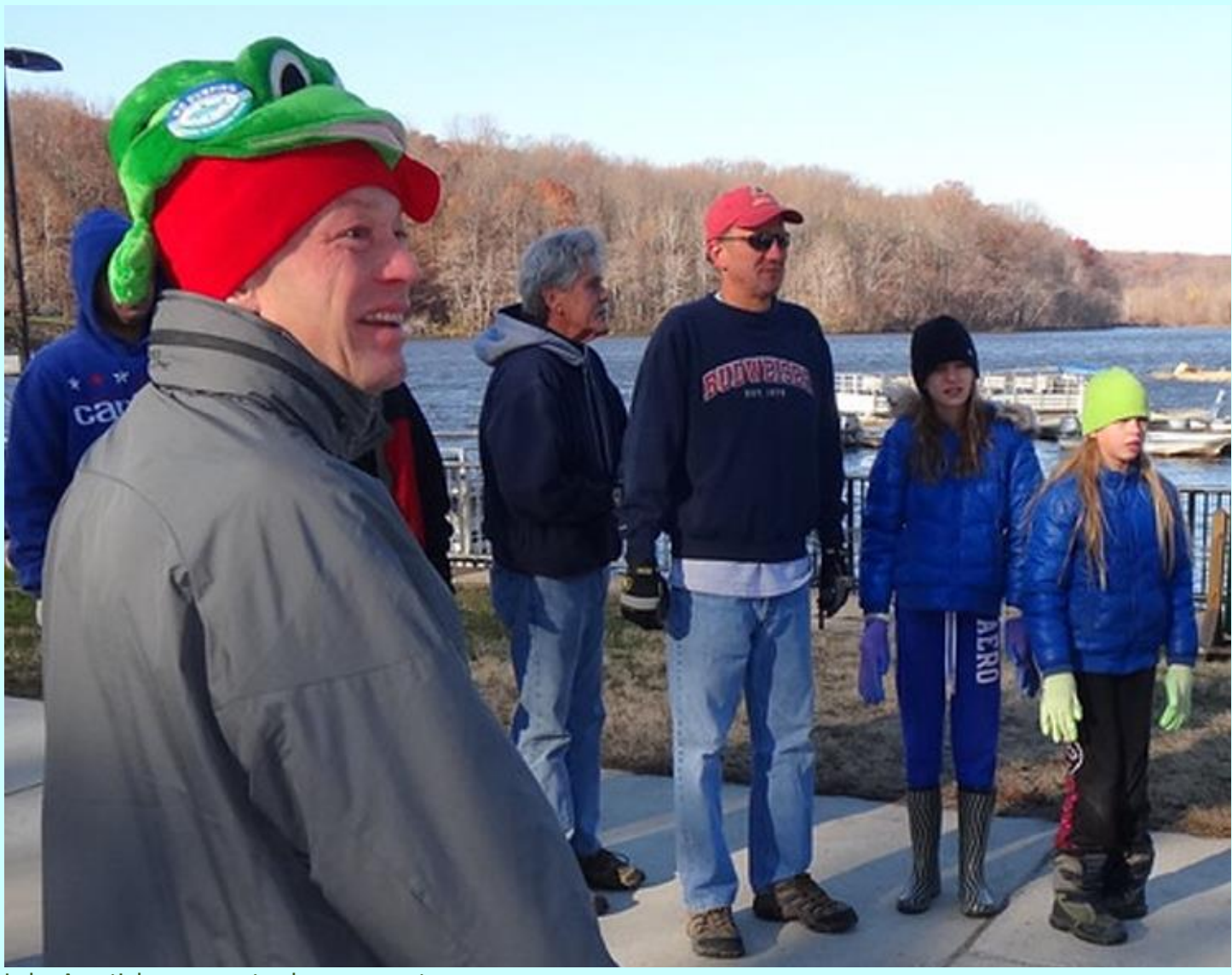
Lake Accotink - corporate cleanup event