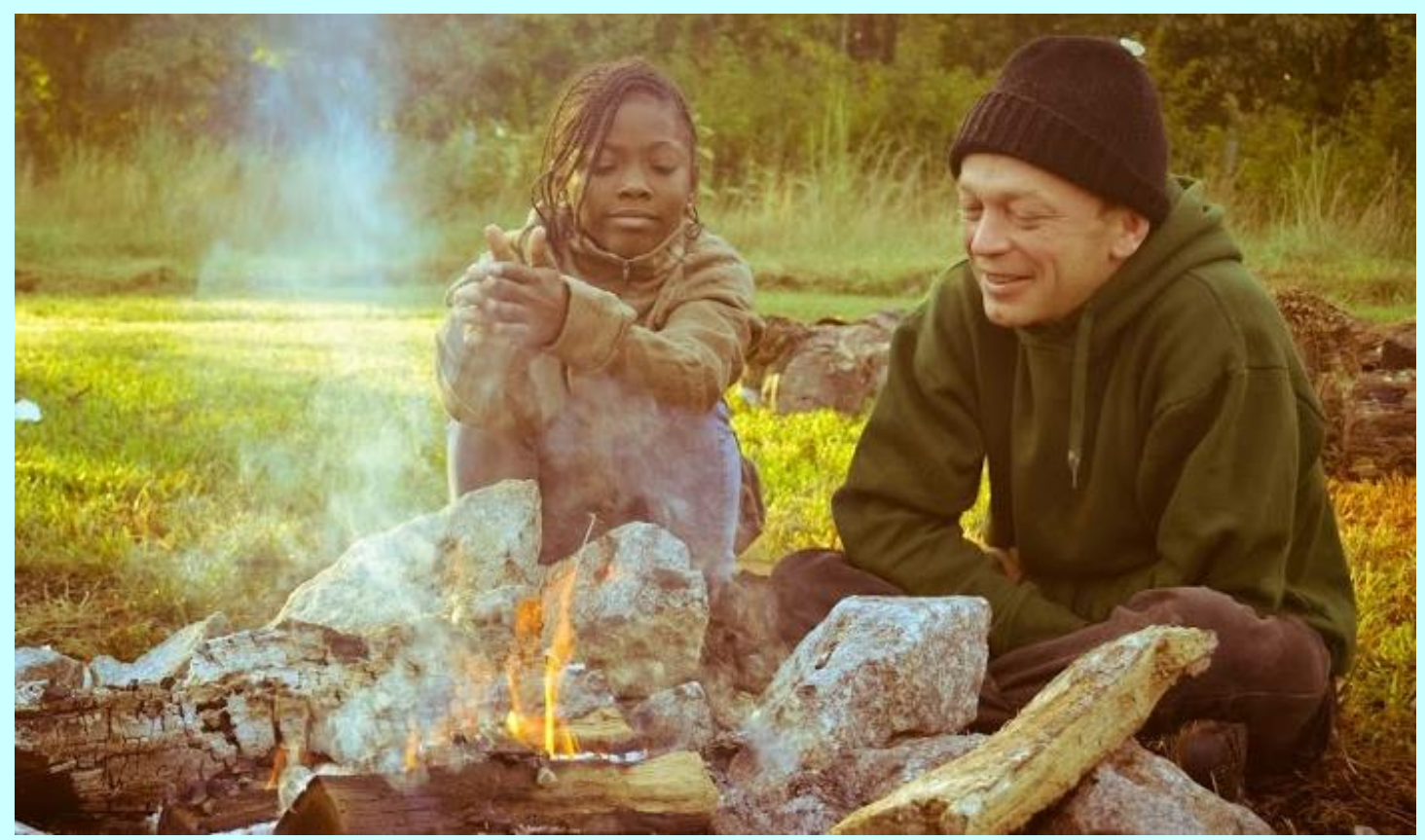
Meadowwood Recreation Area - Inspiring Connections Outdoors youth outing