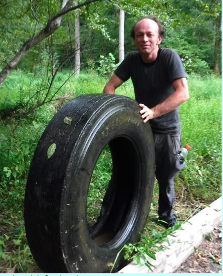
Americana Park - meadow planting