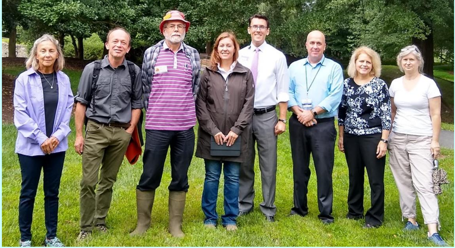
Inova Merrifield - forest preservation walk