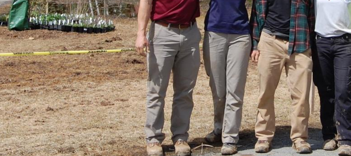
Americana Park - meadow planting