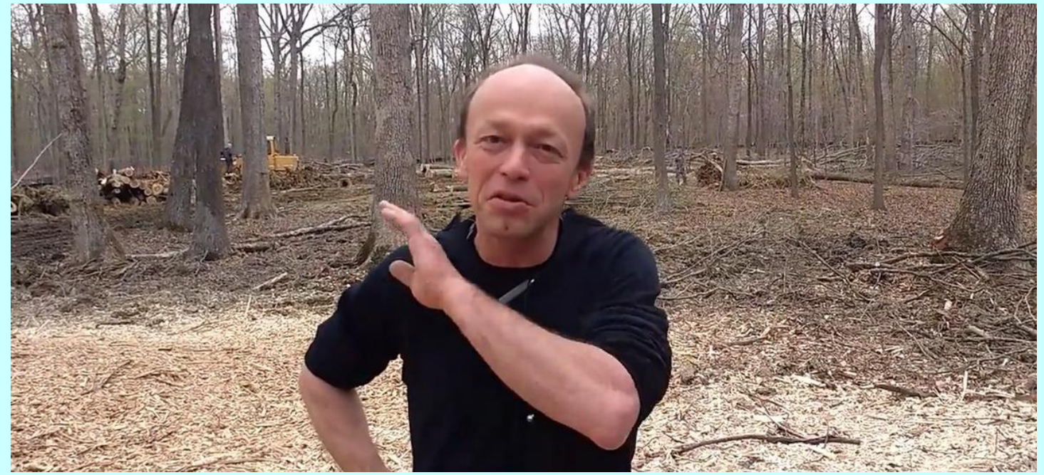
Fairfax - defending disappearing vernal pools