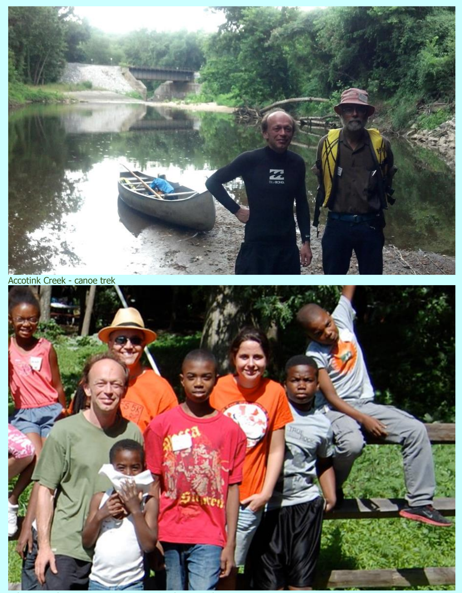
Lake Accotink - Inspiring Connections Outdoors youth outing