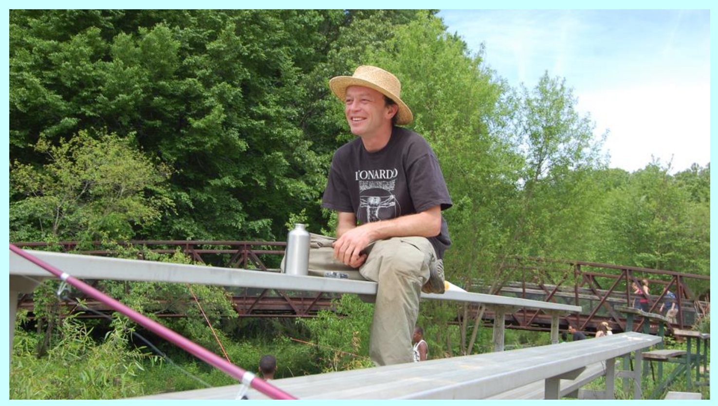
"Be like the plants – grow to the light and never give up"