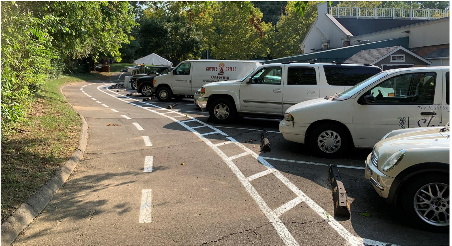
* The City's existing Main Street Marketplace trail connection