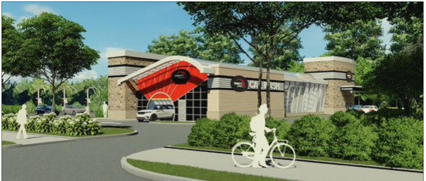
The vision of inviting pedestrian and bicycle travel at the car wash proposed on Fairfax Blvd at Lion Run