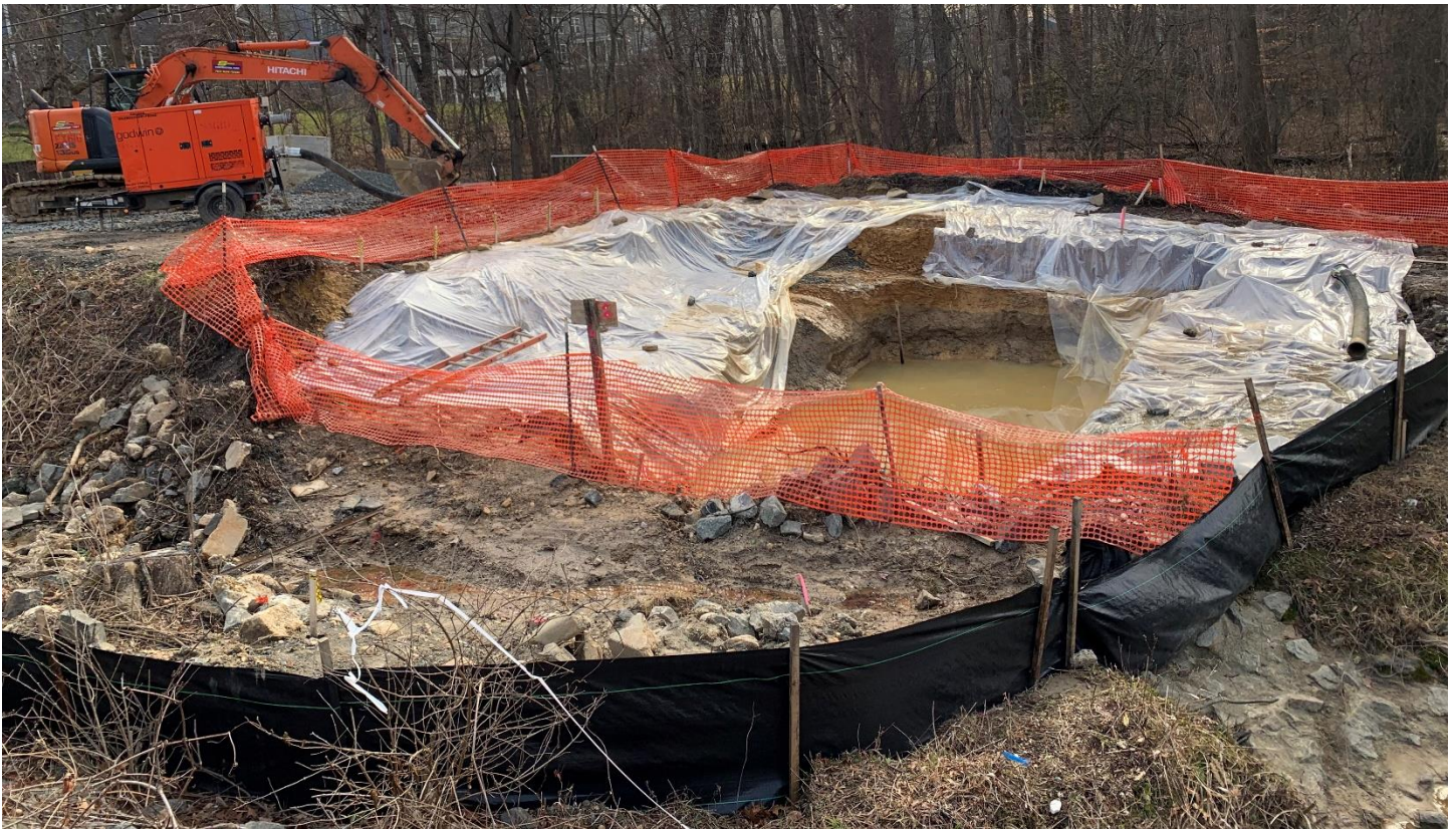
One end of a pedestrian trail bridge under construction by the County. Do we want this times eight to build four bridges in City woodlands for the George Snyder Trail?