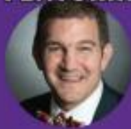
CHAP PETERSEN Honorable Former State Senator