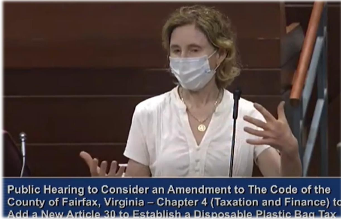
Avril addresses the Board of Supervisors

A brief video is available including our remarks. brief video