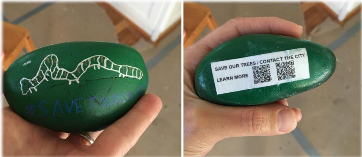
Kindness rocks carry the message – “Be kind to our forests”

The ad hoc committee of interested City residents distributed information door hangers in the surrounding neighborhoods and also placed “kindness rocks” in nearby parks, both with QR codes linking to our webpage.