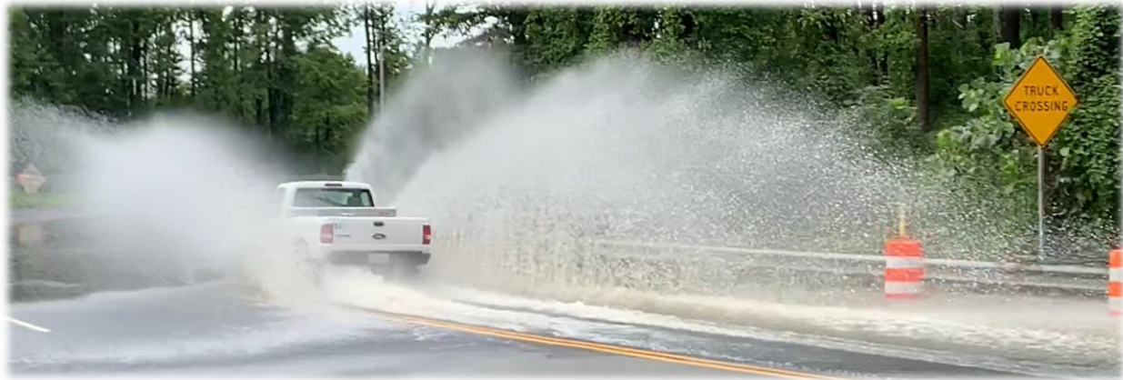
Cinder Bed Road underwater