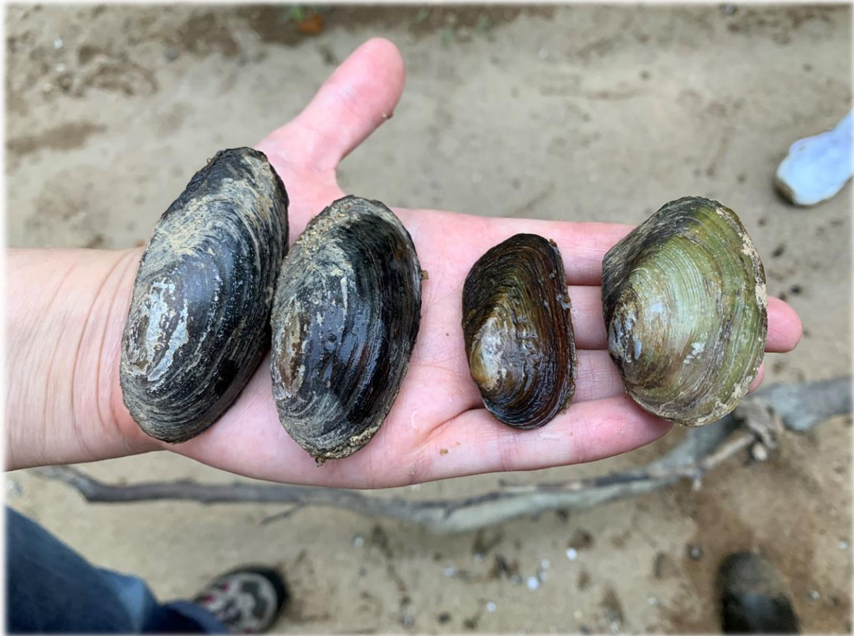
Three rescued Eastern Elliptio mussels, plus one not-so-sure