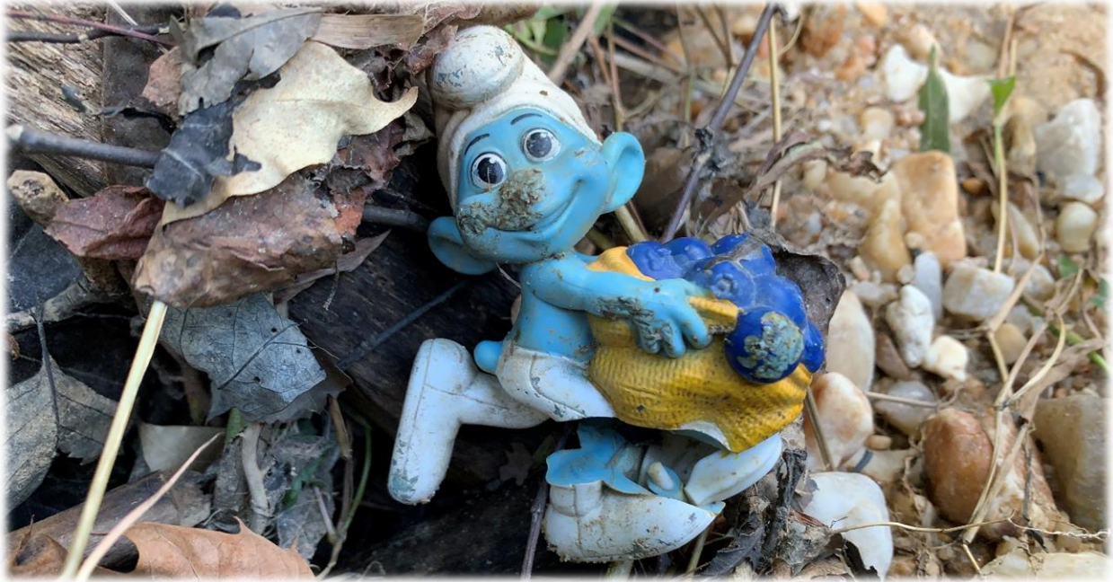
A whimsical find from our first day of the stream cleanup season

We had our first Saturday of cleanups last Saturday. Turnout was disappointing with only two volunteers from the public at our first site, none at our second, and a bit better showing of seven at our last site. Our most unusual find of the day was a Smurf figurine.