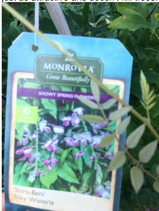
Asian wisteria for sale at the Merrifield Garden Center, Fairfax County

2) Ask your legislators to ban sales of all invasive plants! Chinese and Japanese wisterias are sold in garden centers all over the Commonwealth. American wisteria is just as attractive and doesn't kill trees.