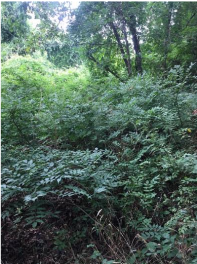
before colonizing the entire understudy.