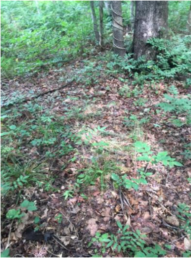
Wisteria starts out small...