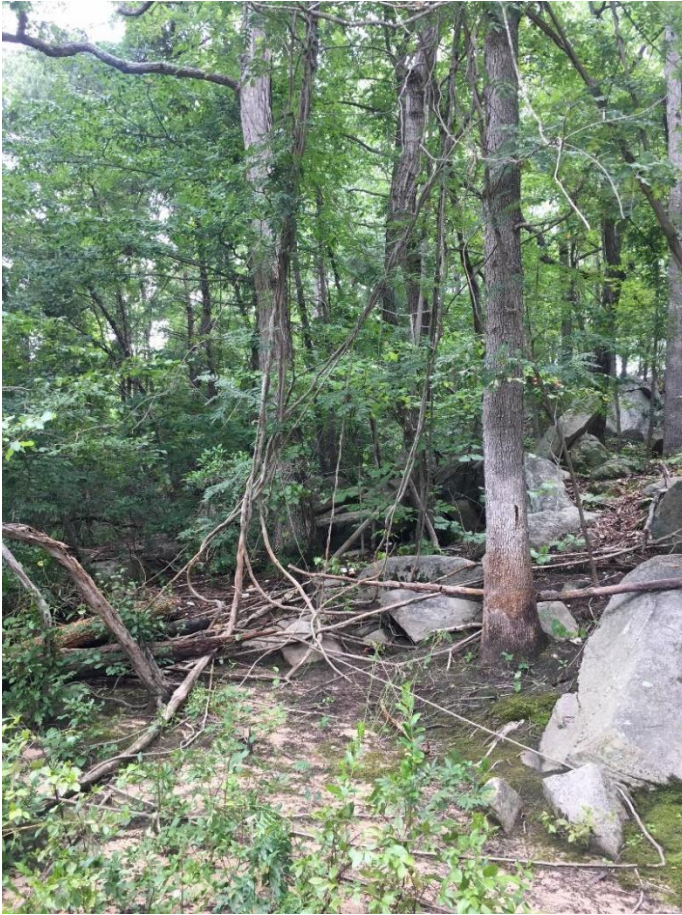
Its vines crisscross the ground like cables.