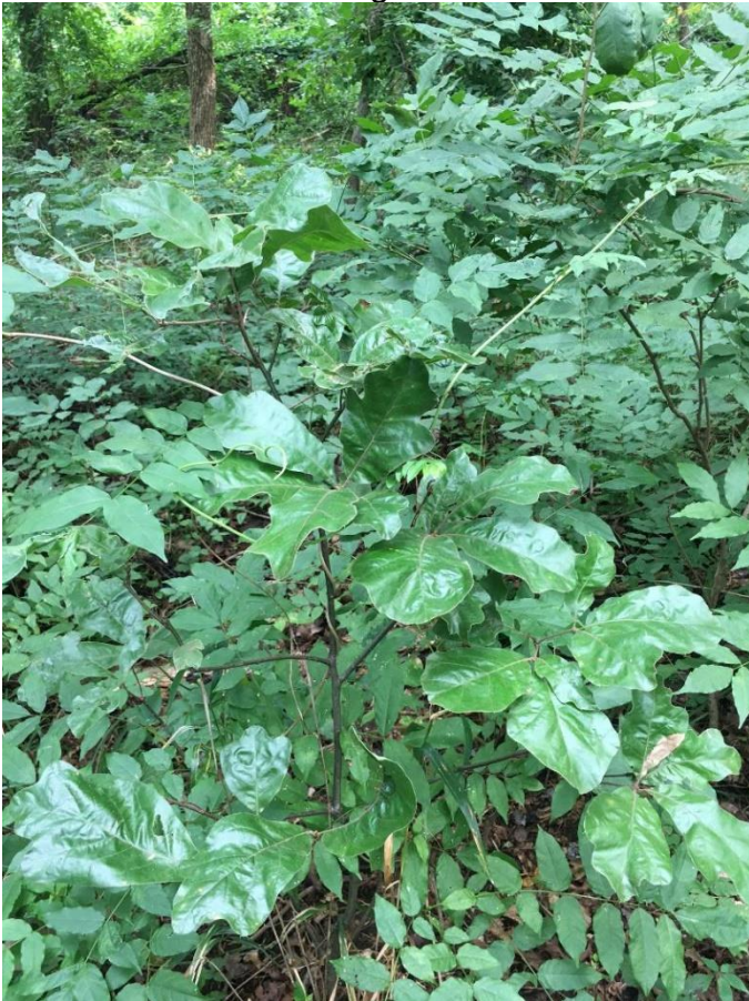
Its foliage smothers a native oak sapling.