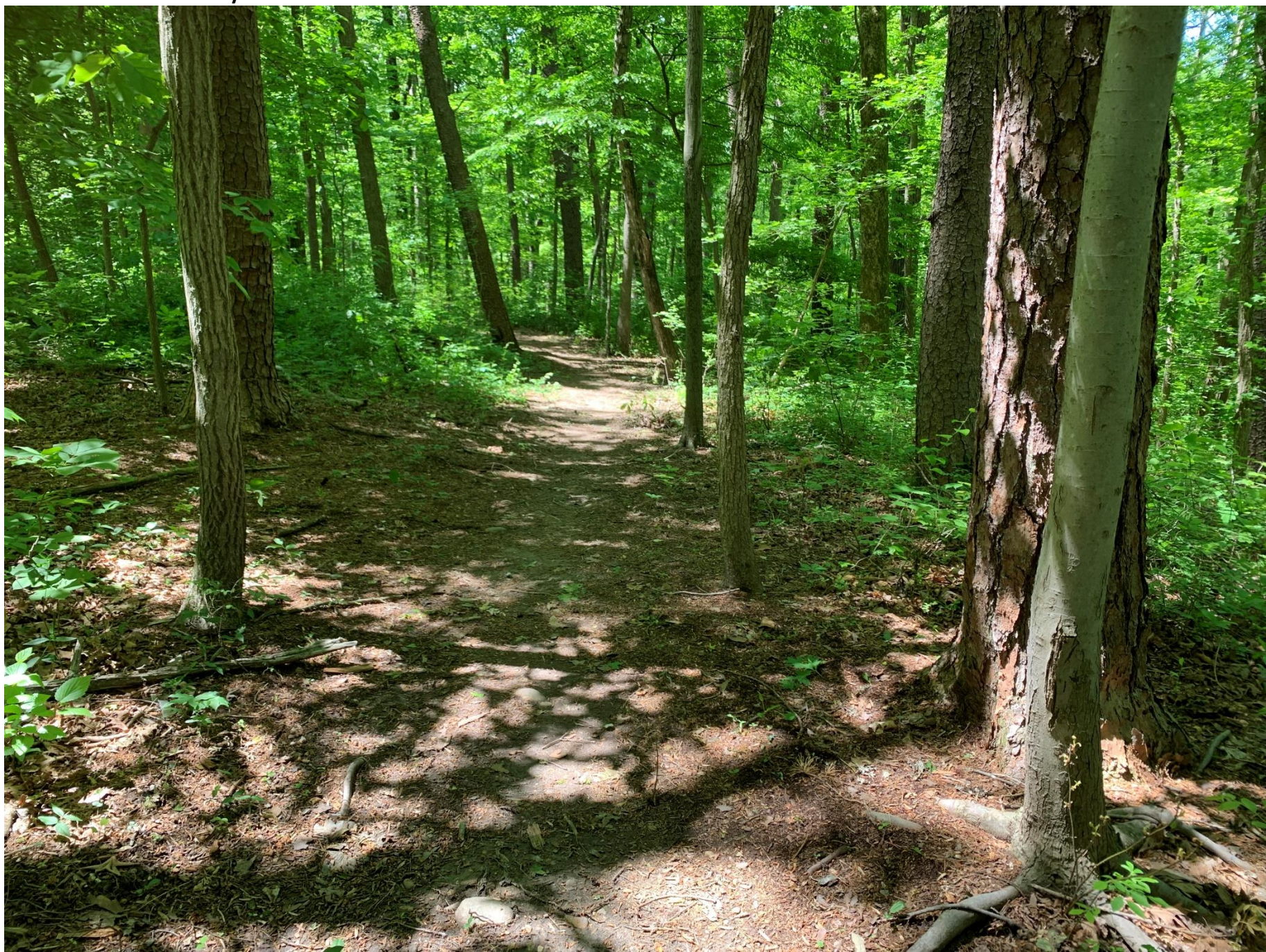
Picturesque footpaths do not need pavement