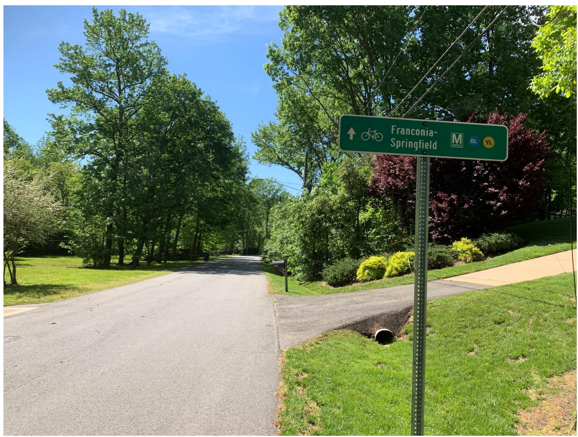
Existing designated bike path to Metro on tranquil Barry Road