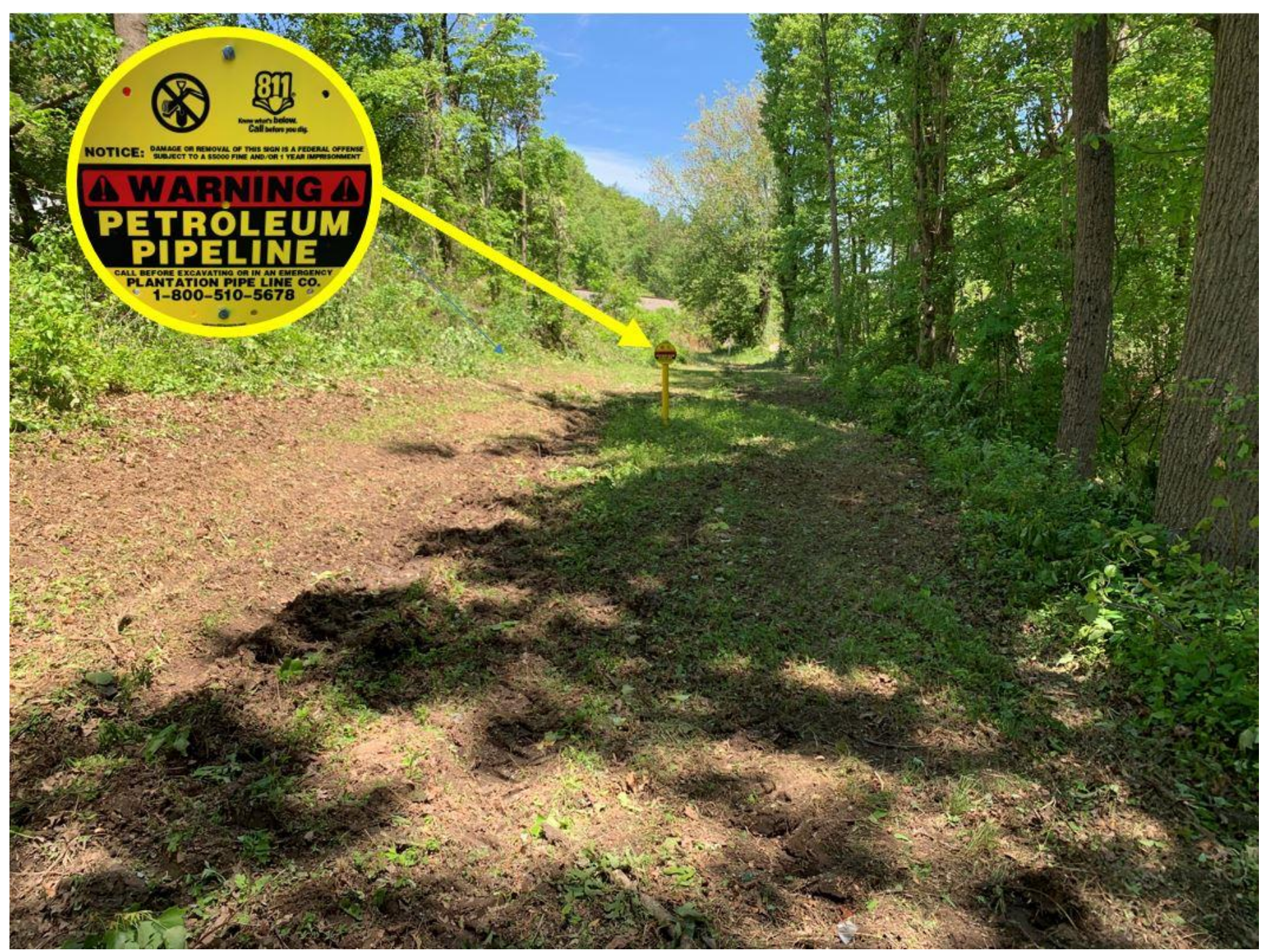
Petroleum pipeline - These woods are already crisscrossed with human transportation infrastructure