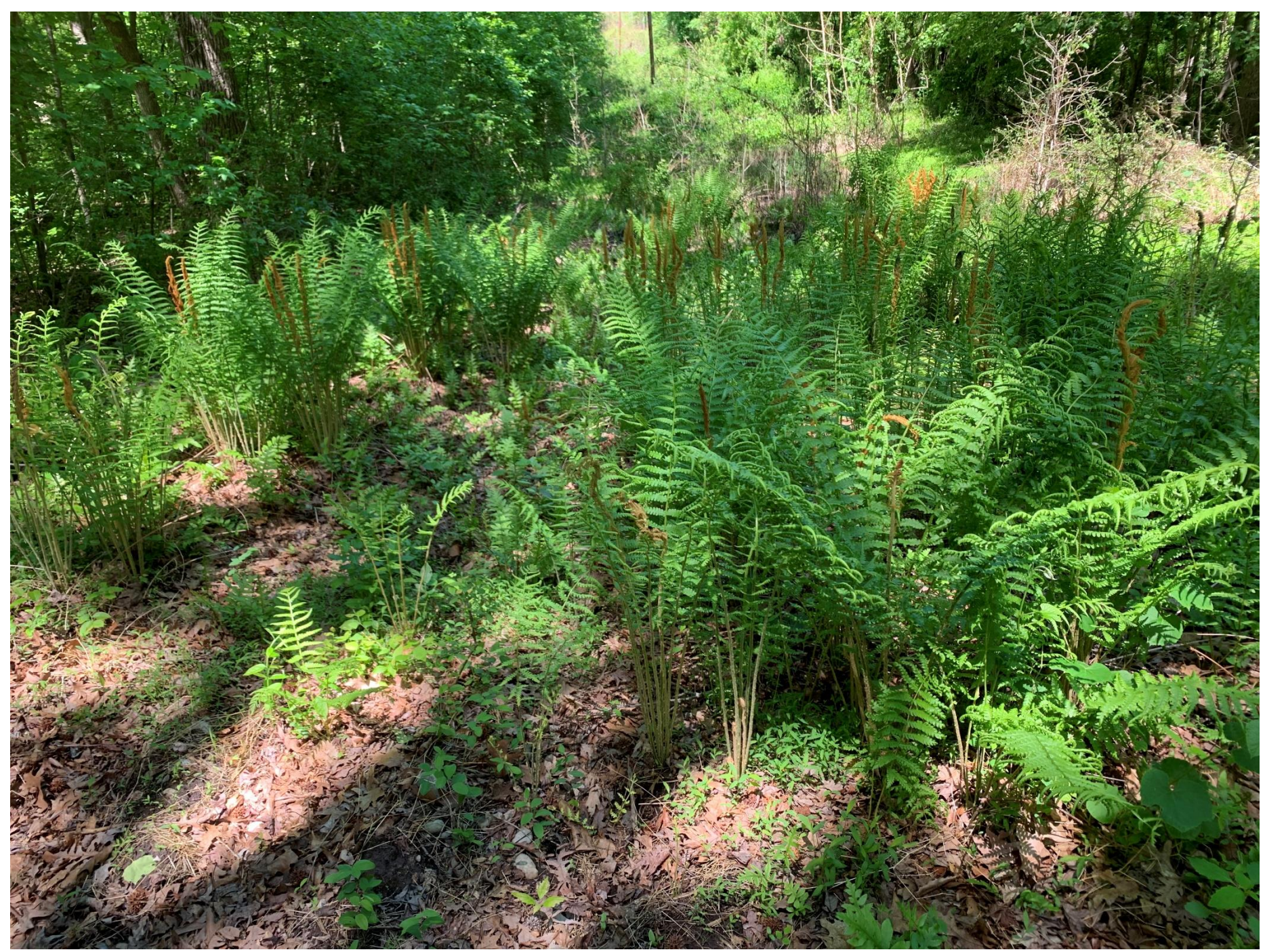
Extensive stands of Cinnamon Ferns, a wetland species