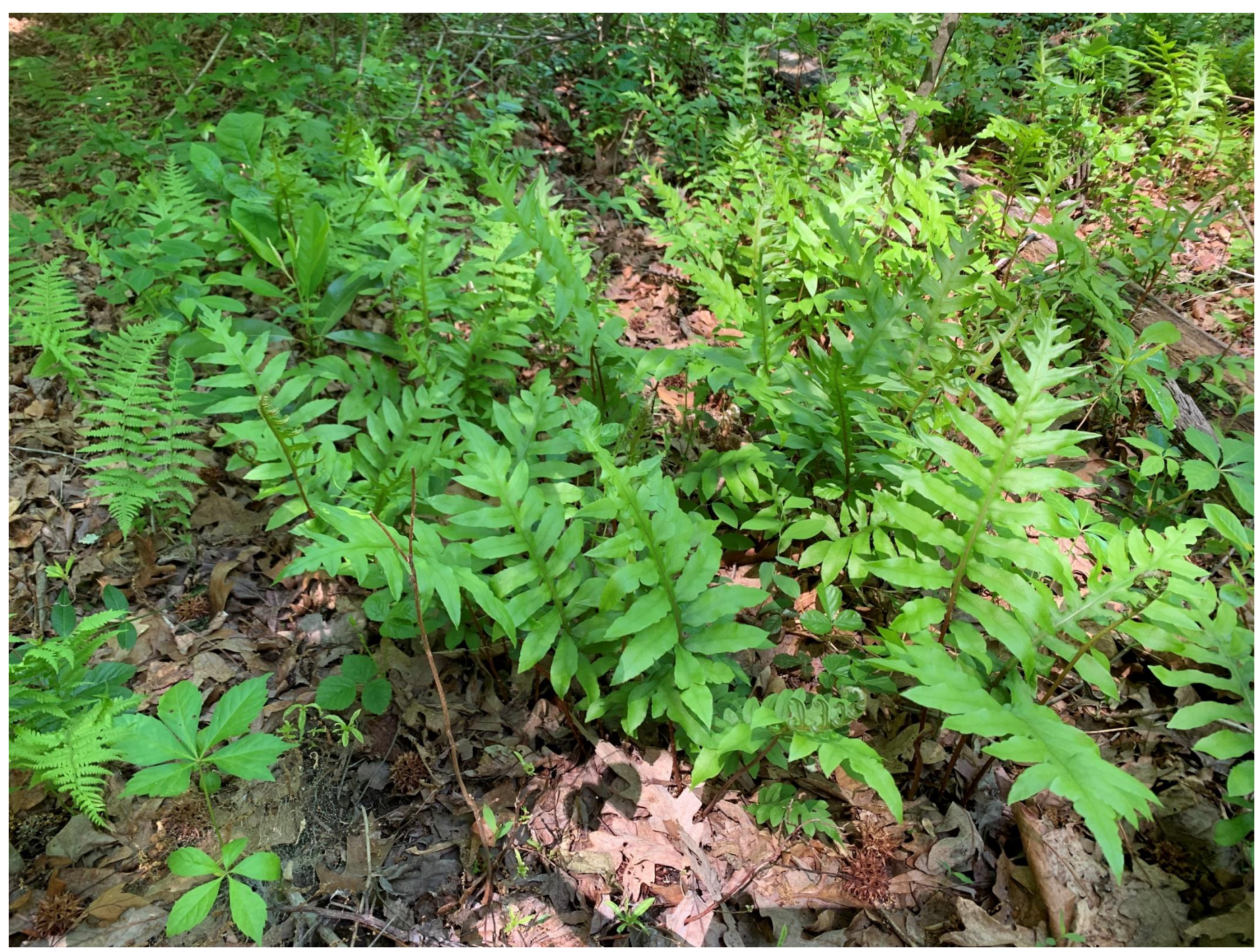
Netted Chain Ferns, a wetland species