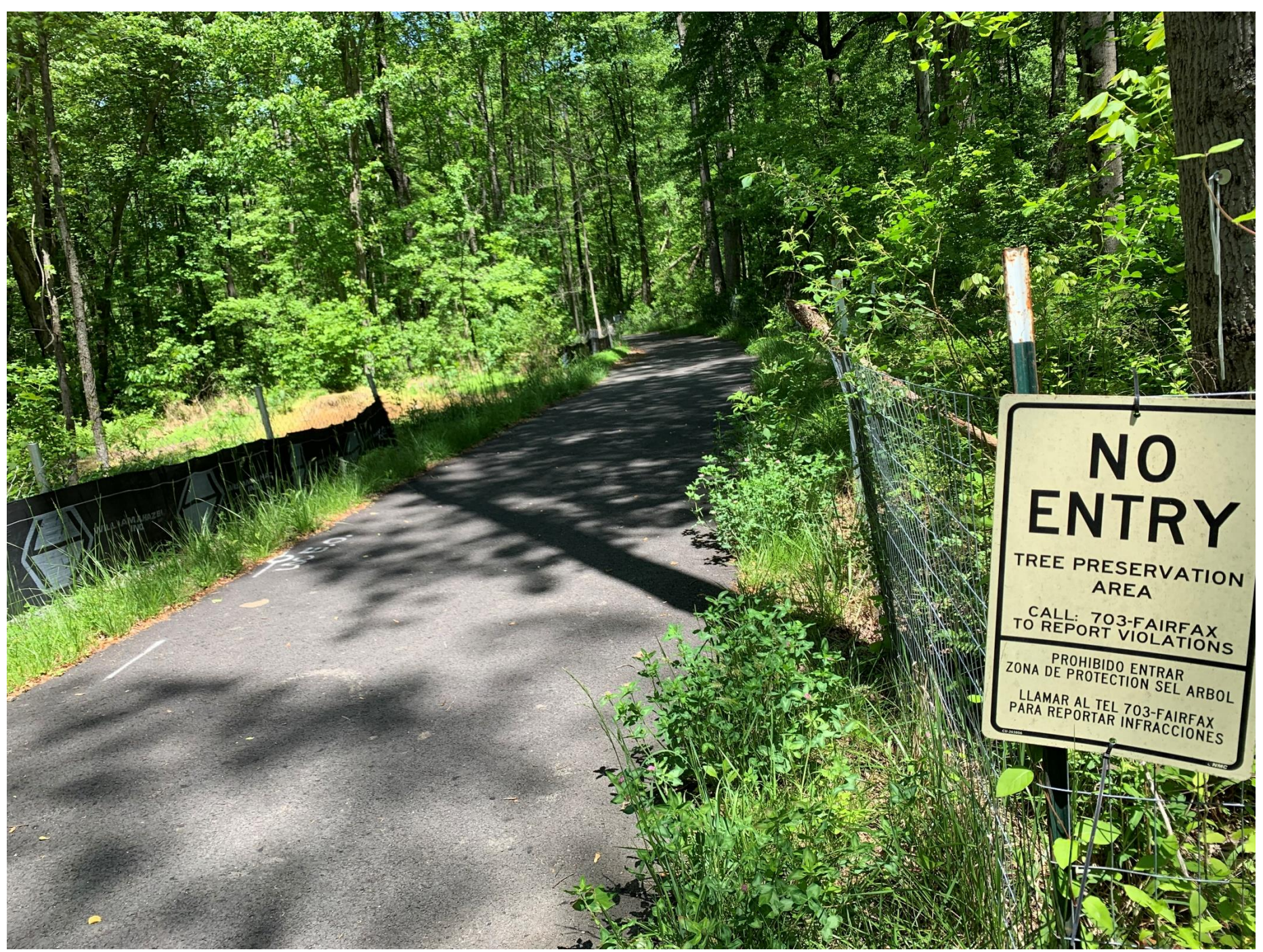
Unfortunate recent northern extension of existing Island Creek Park paved trail – This whole area should have been a "tree preservation" area.