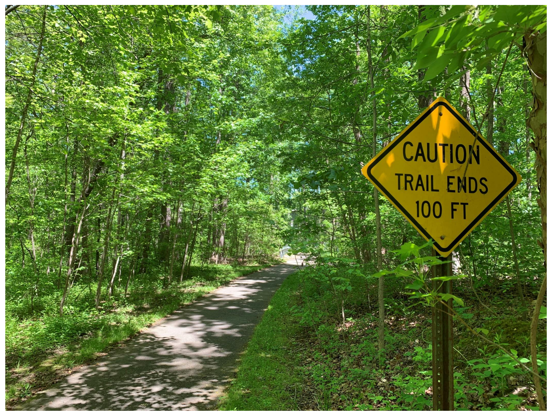
Unfortunate recent northern extension of existing Island Creek Park paved trail