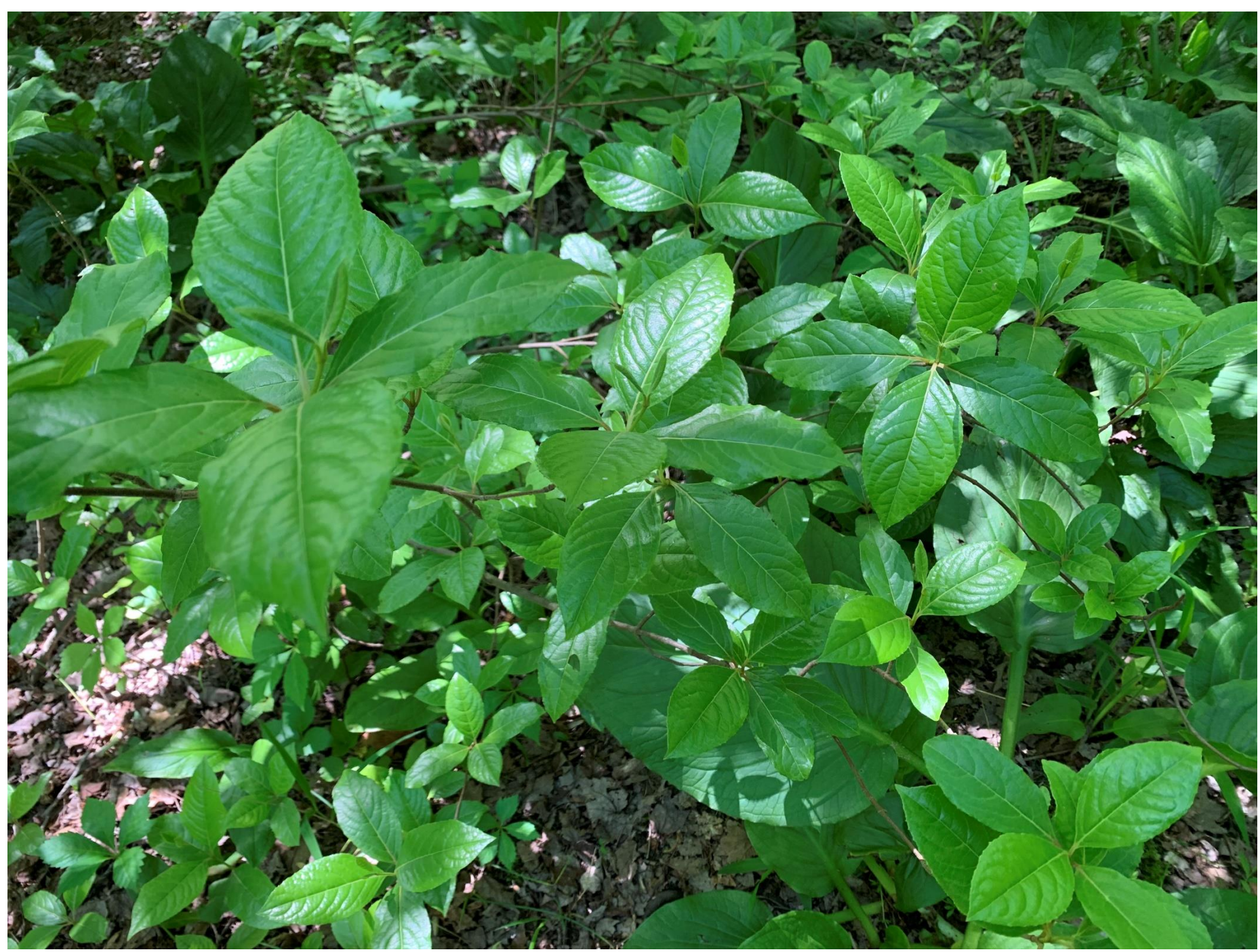
Possumhaw, an uncommon wetland species