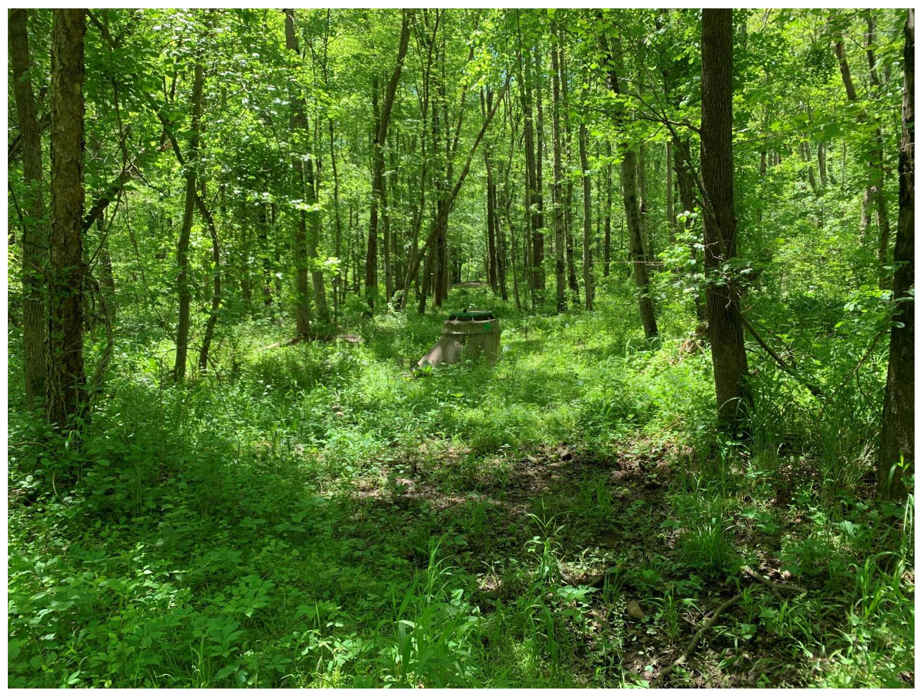
Sewer line on west side of Long Branch - These woods are already crisscrossed with human transportation infrastructure