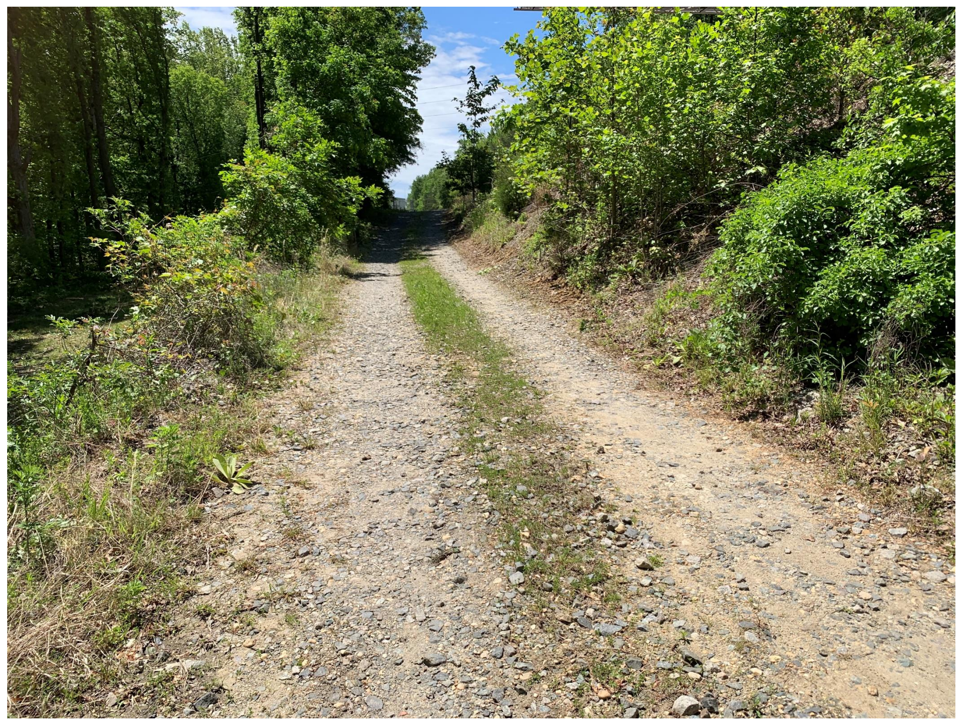
Railroad maintenance road - These woods are already crisscrossed with human transportation infrastructure