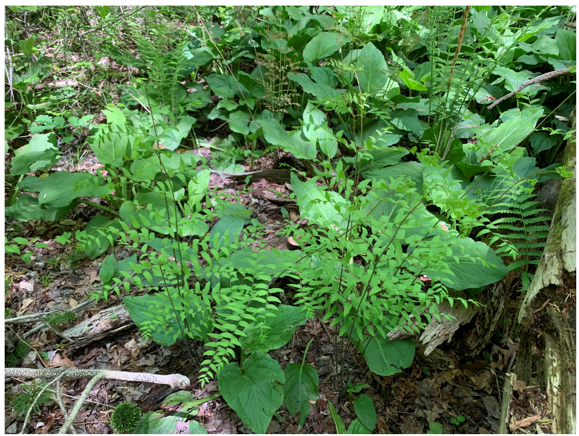
Royal Fern, a wetland species