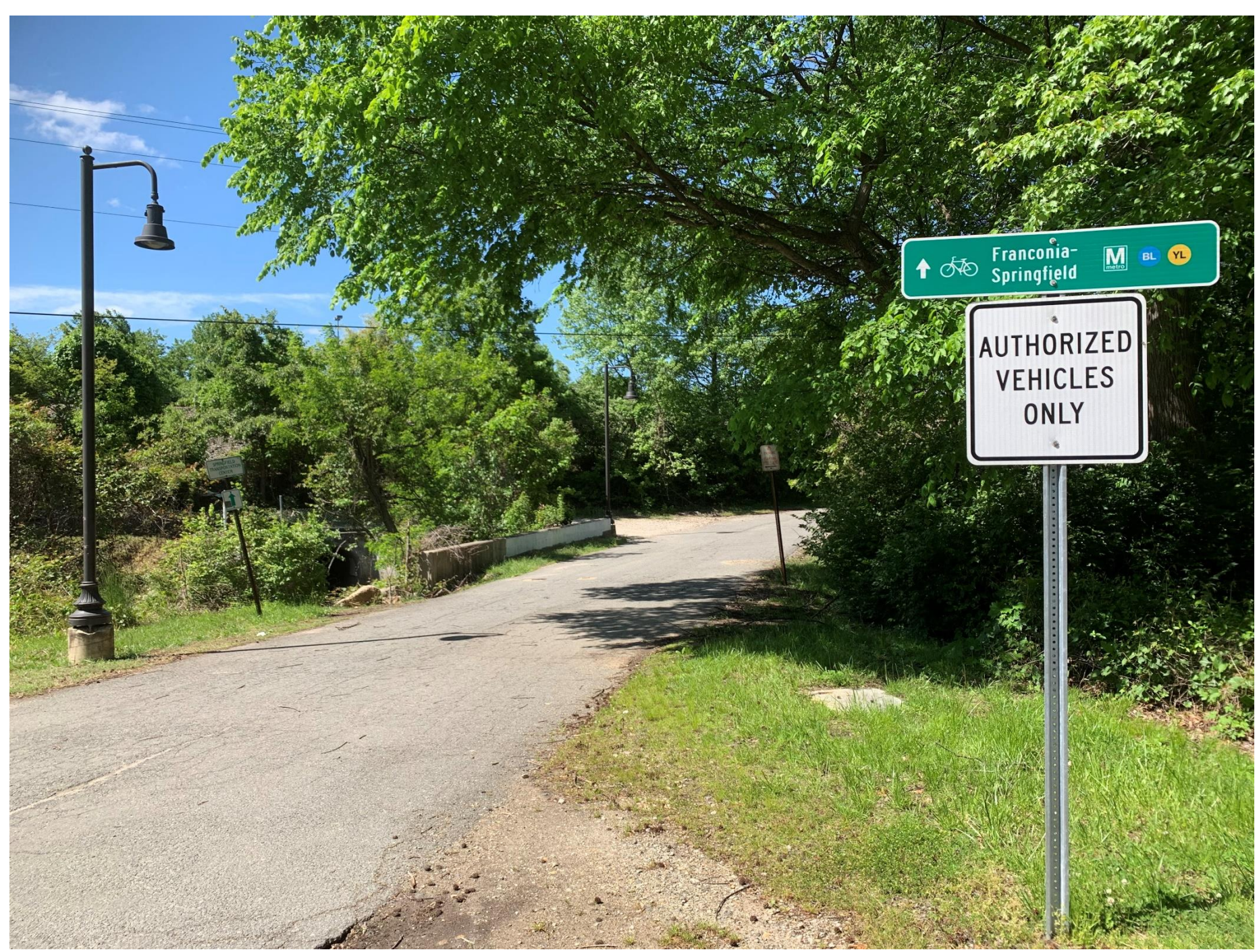
Terminus of existing designated bike path to Metro on tranquil Barry Road