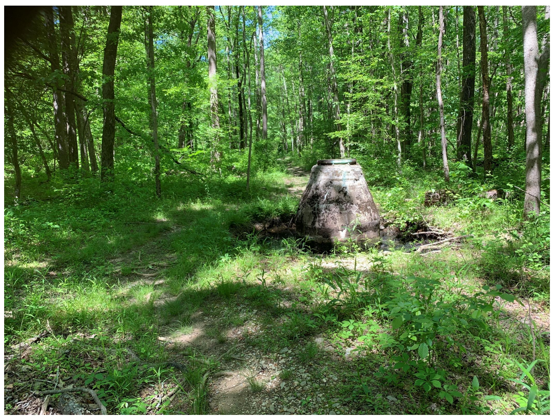
Sewer line on east side of Long Branch - These woods are already crisscrossed with human transportation infrastructure