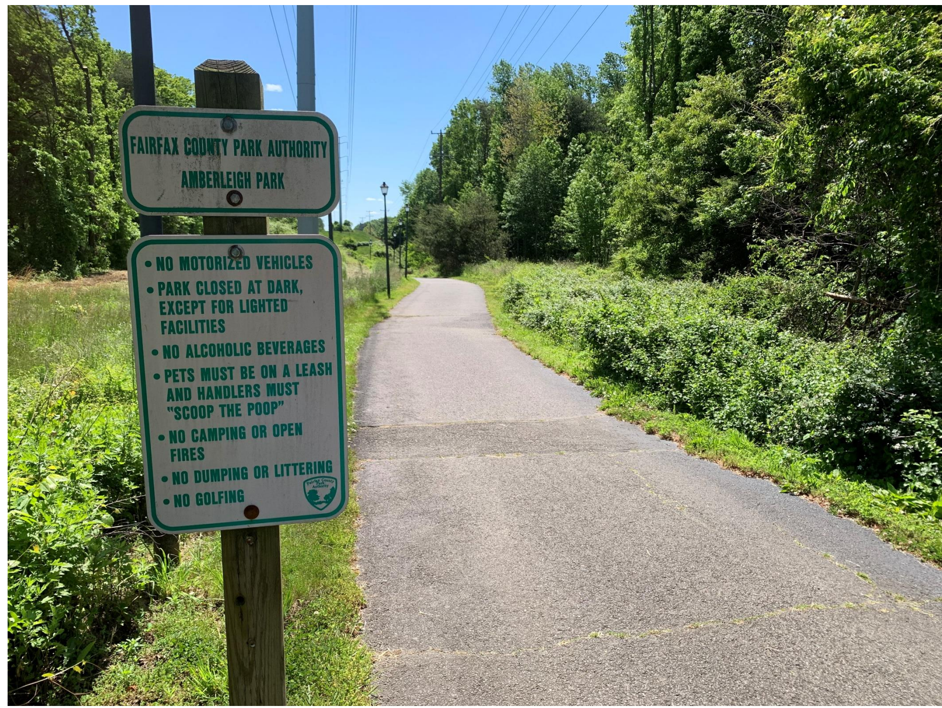
Existing Amberleigh Park trail connects Morning View Lane and Crestleigh Way