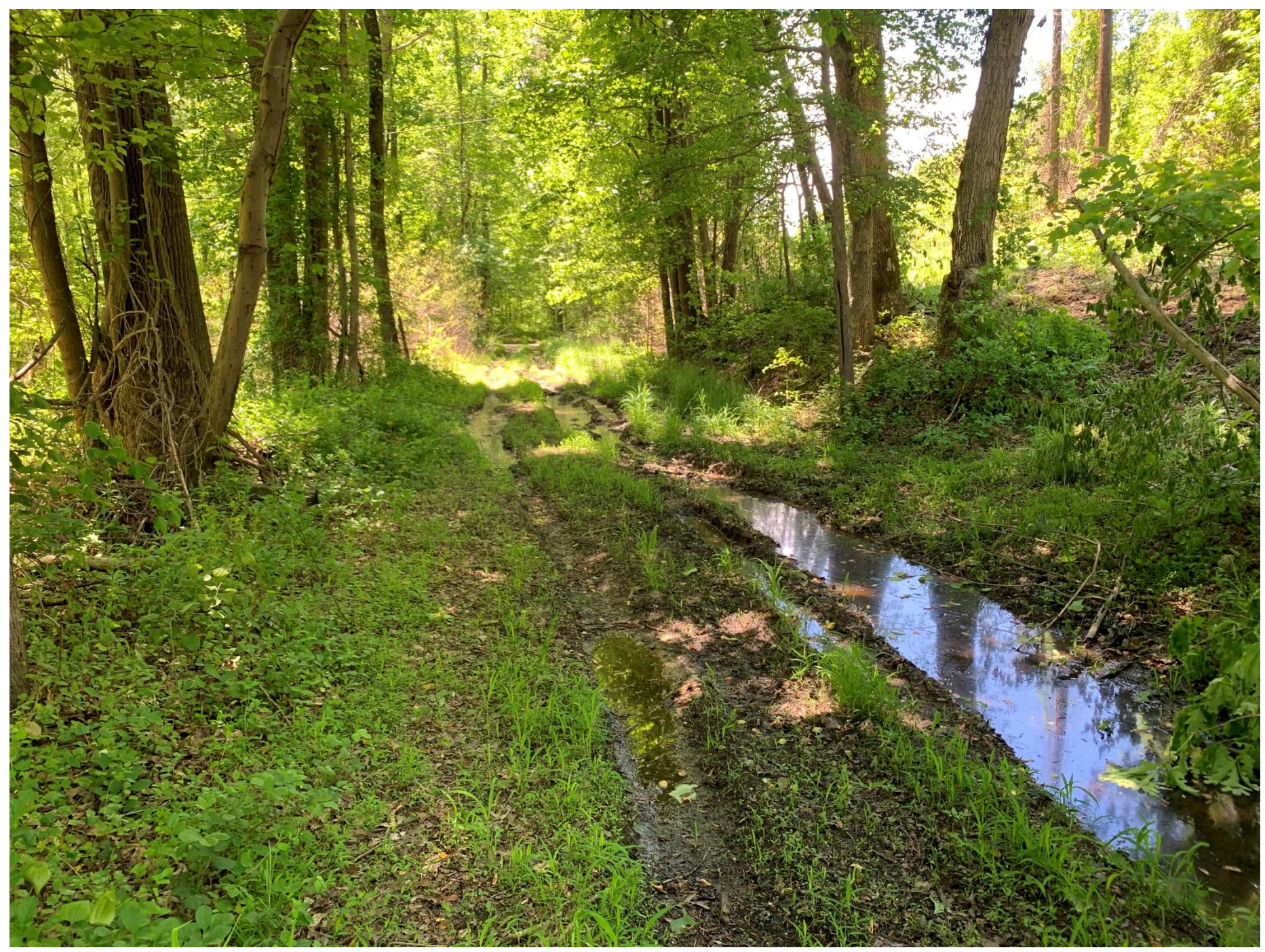
Utility access road - These woods are already crisscrossed with human transportation infrastructure