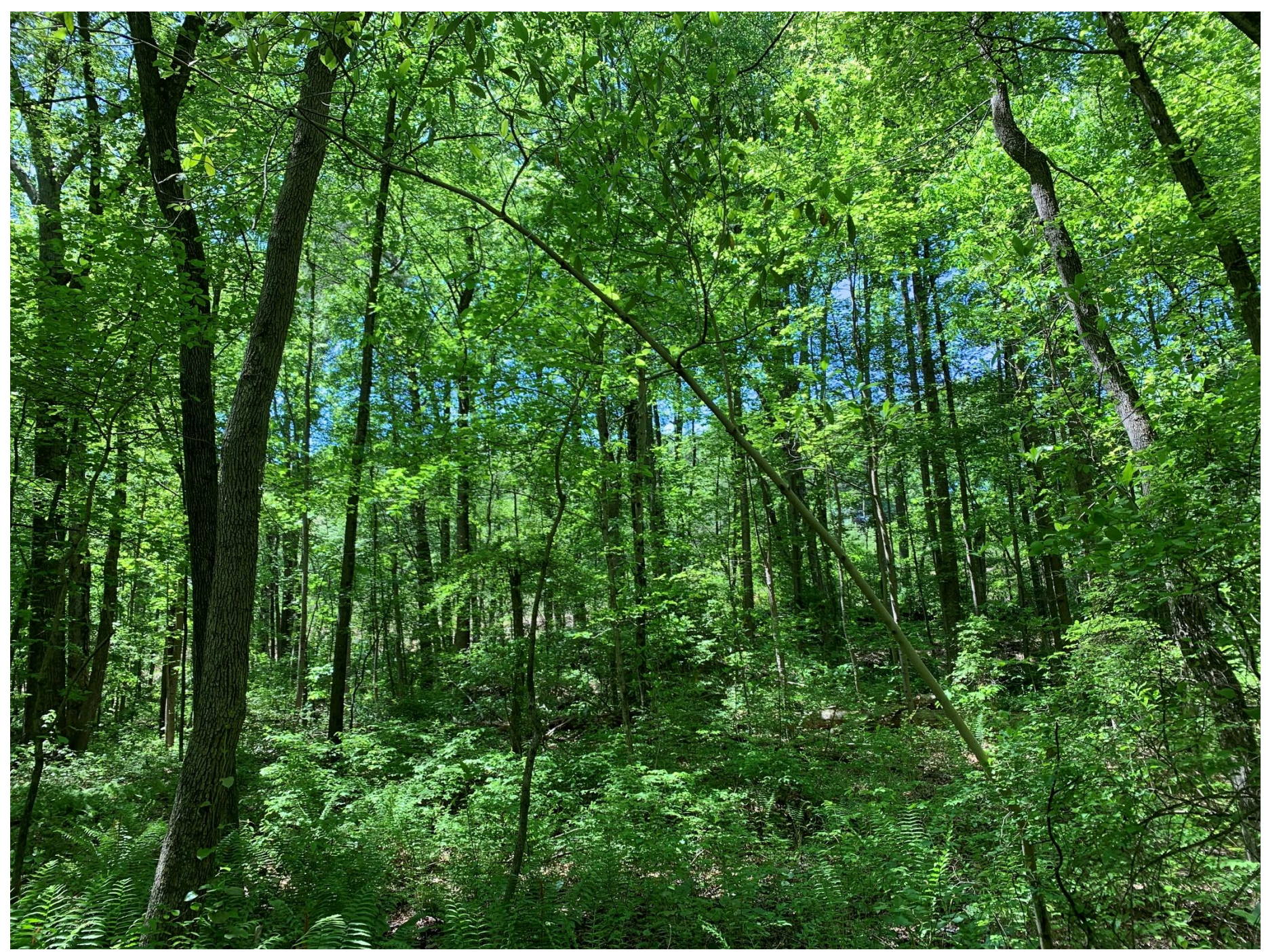
Sweetbay Magnolia, a rare wetland species, with its characteristic leaning slender trunk