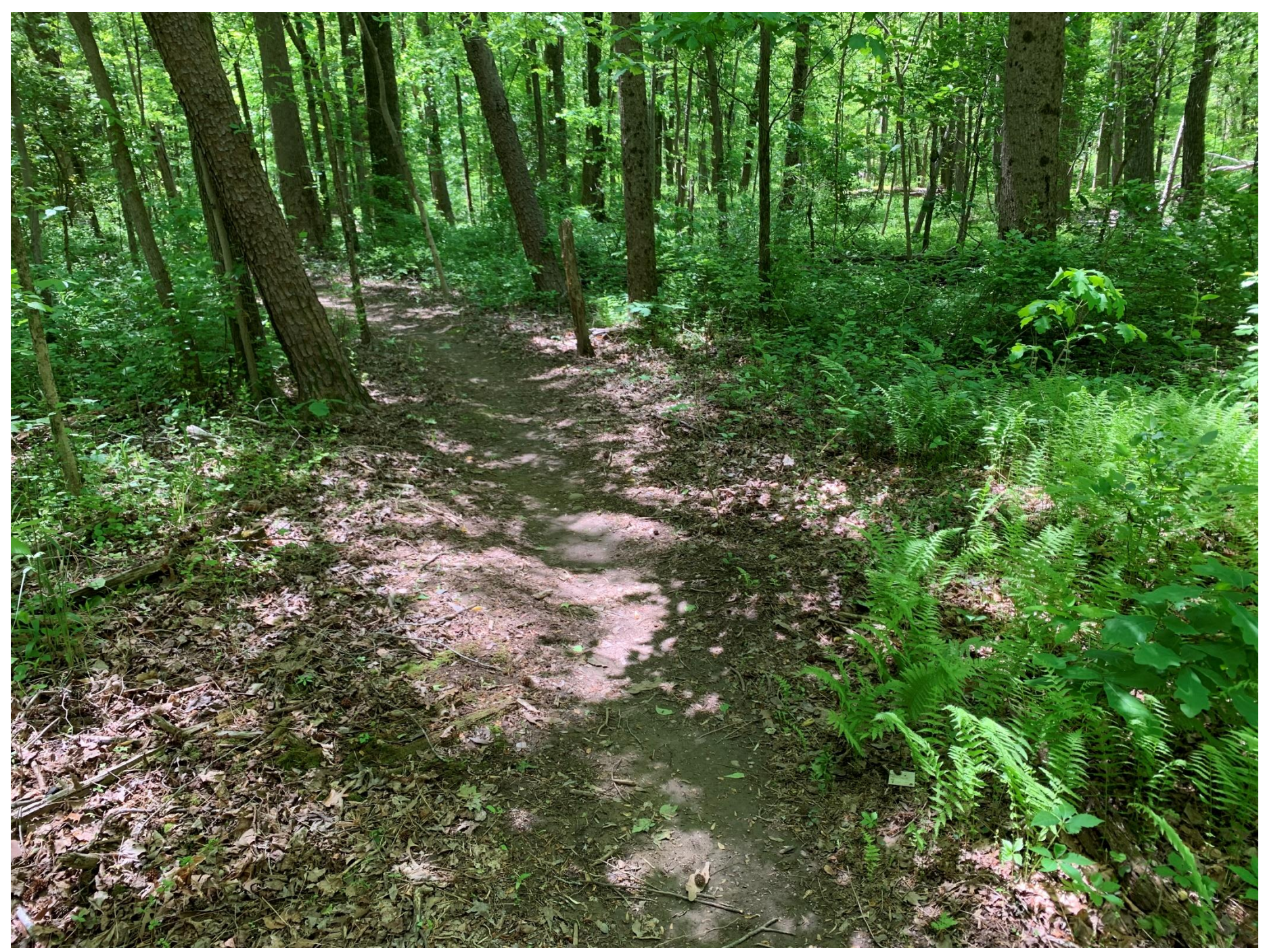
Picturesque footpaths do not need pavement