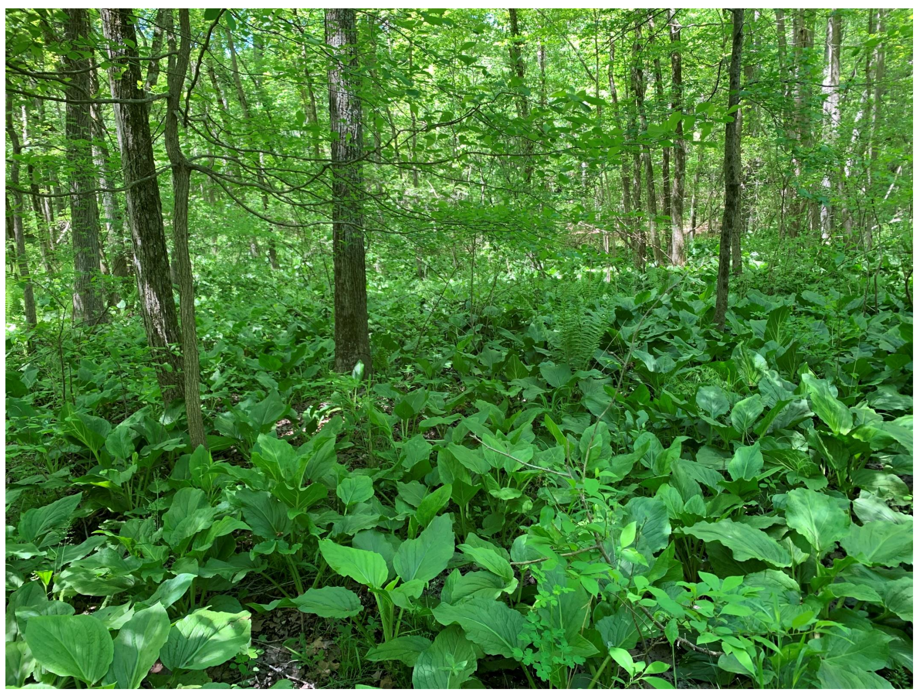
Large expanses of Skunk Cabbage, a wetland species