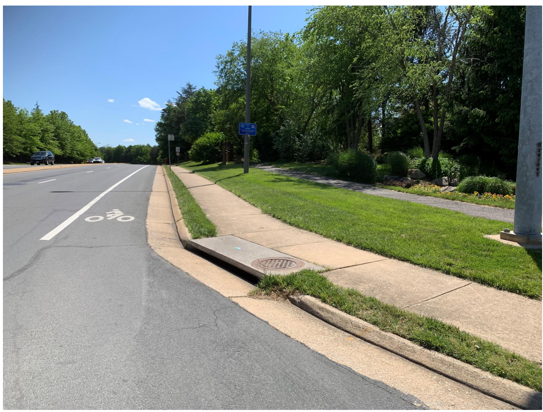
Existing bike lanes on Beulah Road and pedestrian path in Island Creek community are options.