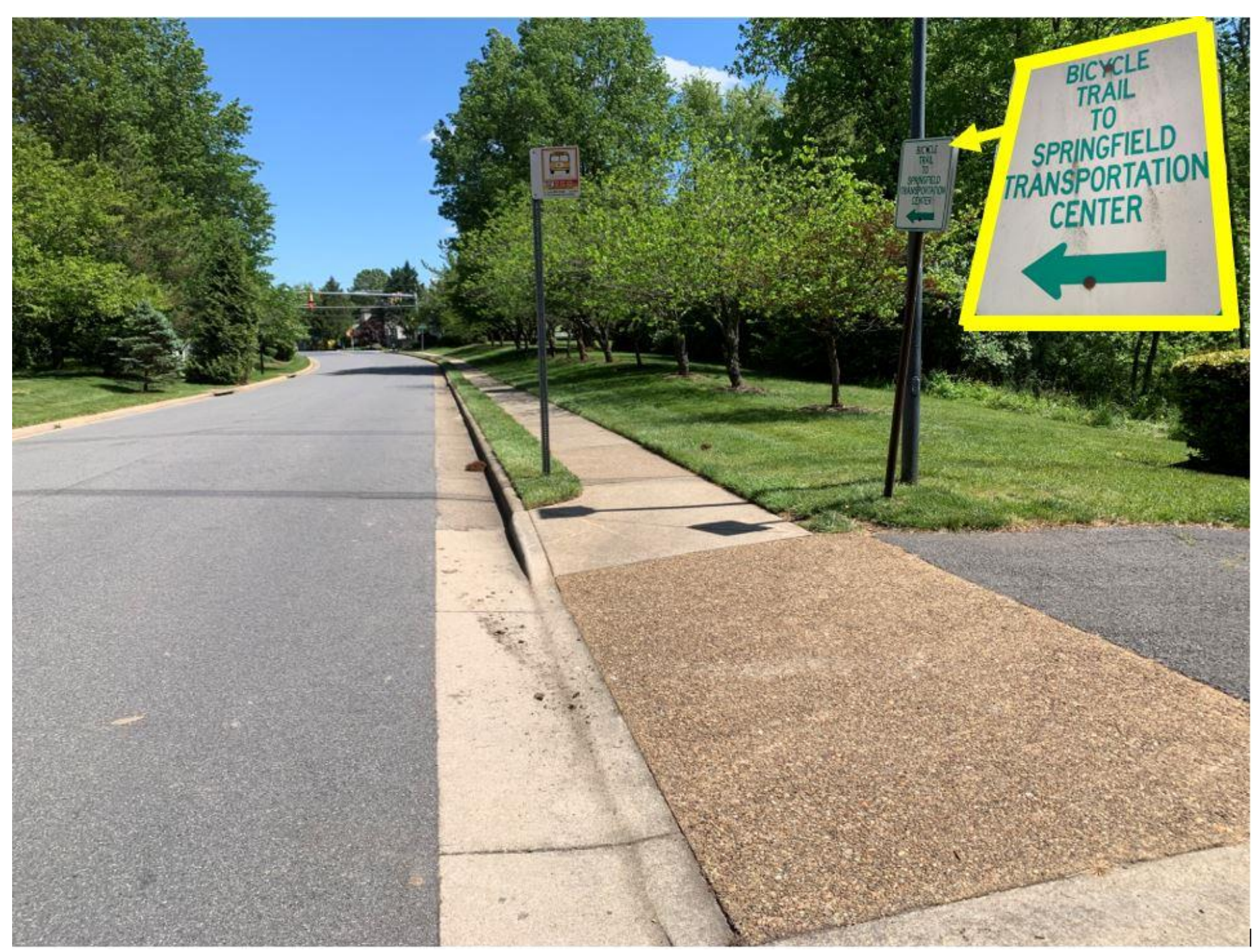
Crestleigh Way – Does this street look intimidating to bicyclists?