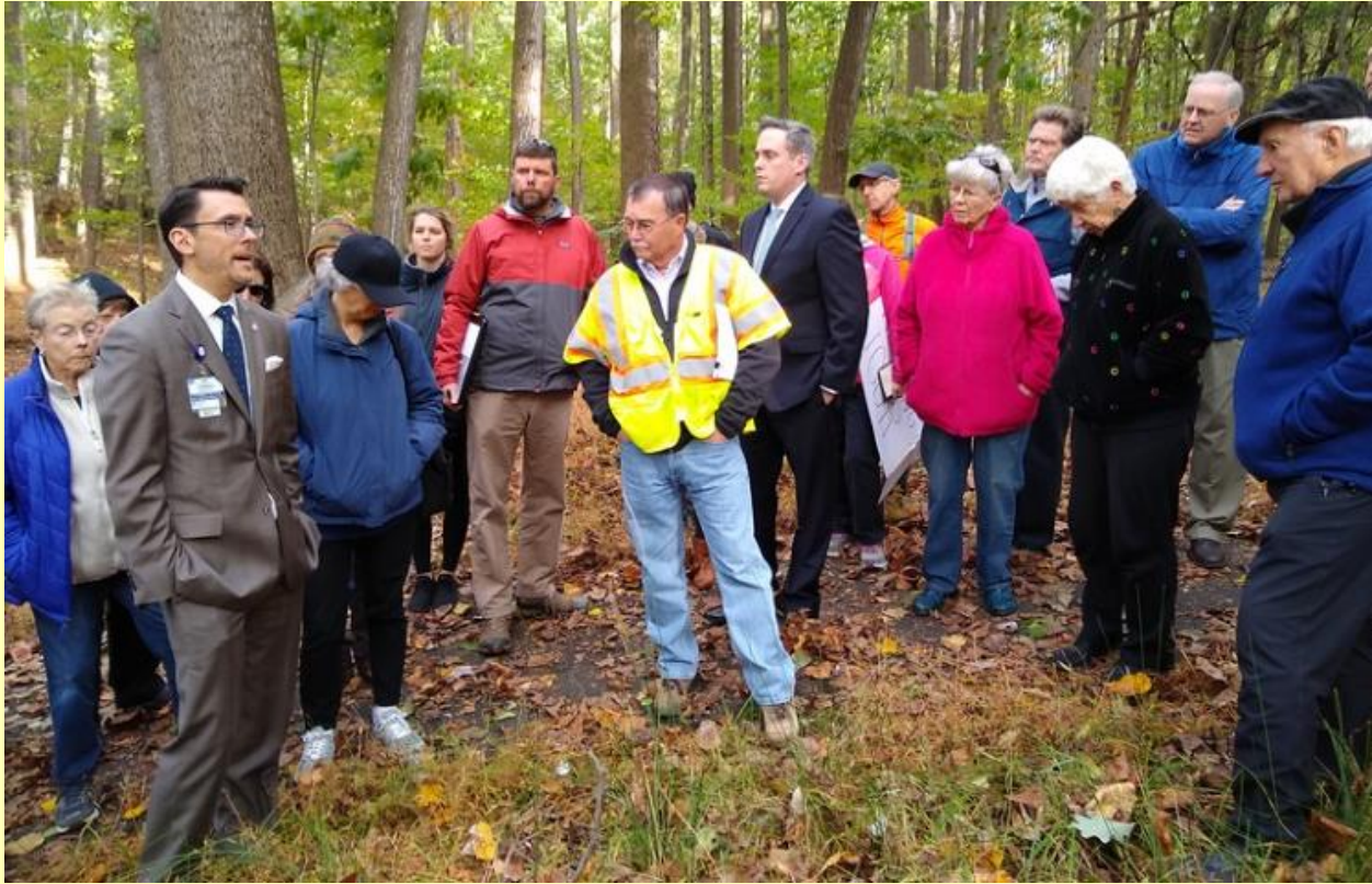
The group talks things over along the trail

There were 45+ participants. The group walked through some of the wooded areas, some of which are destined for preservation and some destined to be built upon. The group made several stops to discuss aspects of INOVA's plans and opportunities. The general tenor of the conversation was celebratory - "All praise INOVA".