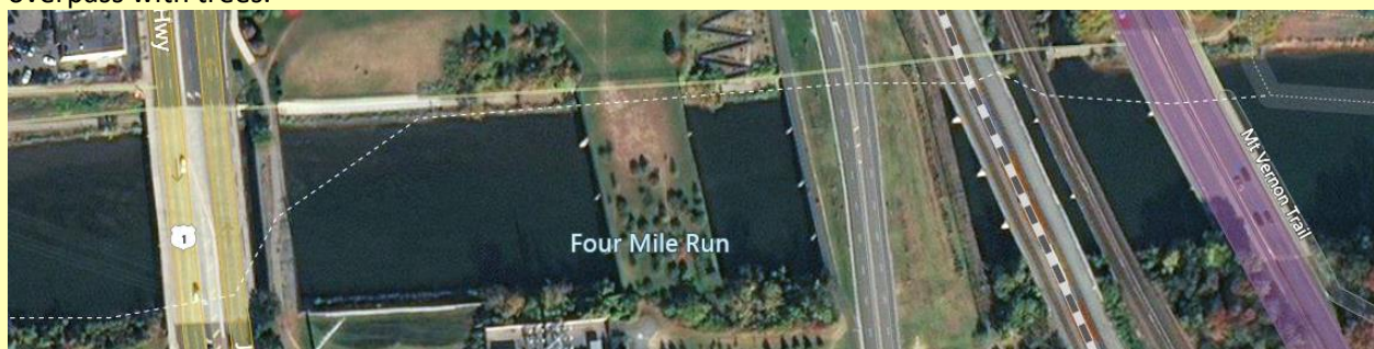
Vegetated Four Mile Run bridges at Potomac Ave and Route 1

Urged habitat connectivity to Holmes Run downstream, pointing out Alexandria has a 495 pedestrian overpass with trees.